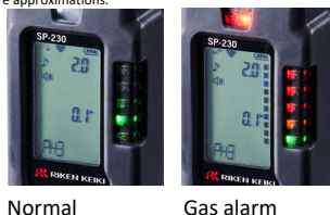
Normal Gas alarm

In addition to the conventional LCD display screen, an LED display is mounted. The current gas alarm point, gas concentration, and operating status are notified in color and on a scale.